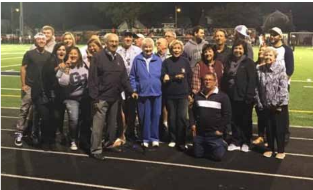
Just a few of the many who participated at Alumni Night on Sept. 8, 2017.